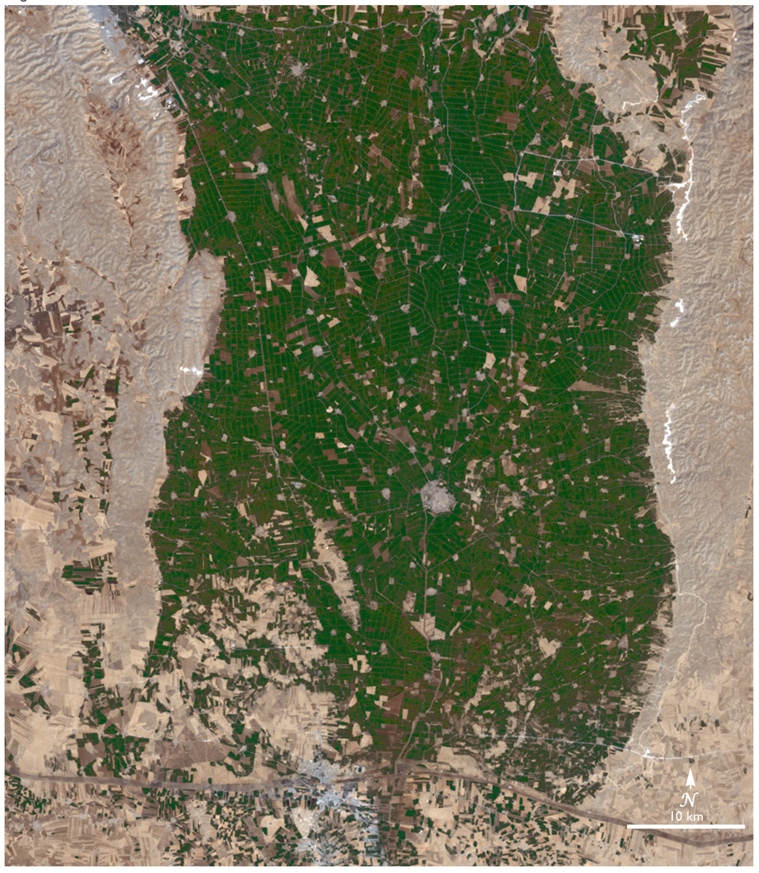
A comparative view of the Harran Plain, 1993 and 2002. The image opposite shows the effects on the land of traditional agricultural methods in 1993. The image above shows the effects of irrigation methods used since the construction of the Atatürk Reservoir. (Data from the TM instrument on the Landsat 5 satellite, opposite; data from the ETM+ instrument on the Landsat 7 satellite, above.)