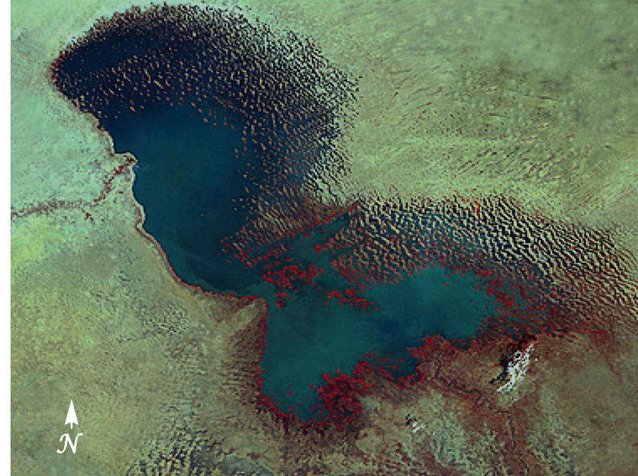
December 1972 and January 1973