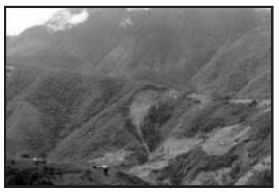
Figure 4. As in Figure 2 but for 9:45 LST, August 29, 1999. The landslide signature area is illuminated laterally and clouds are present.