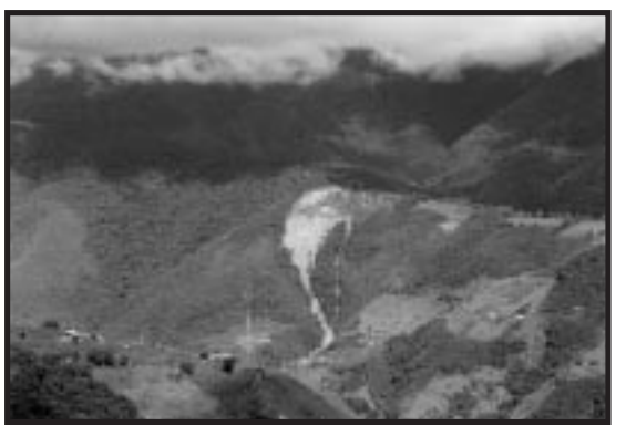
Figure 3. As in Figure 2 but for 12:10 LST, August 27, 1999