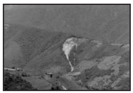
Figure 2. Signature of a landslide developed during the period May 15-18, 1999 in the Andes near Tabay (Venezuela). Time and date of picture are 11:45 LST, May 18, 1999. This Figure is a sector of the corresponding whole color print.