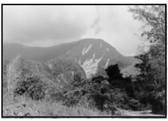
Figure 1. Signature of a landslide in the Henry Pittier Forest Park (Venezuela) that occurred on September 6, 1986. Date of picture is May 1, 1989.

Image format: Images constituted by 640 pixels/line in the West-East direction (left-right of screen) with 250 lines in the North-South position (top-down of screen) that could be fitted to single computer screens are very useful for analysis without problems related to image fitting. That format represents an area of about 22 km x 9 km if the pixel is 34-m wide by 34-m high. An approximate search radius of 8 km centered on the geographical co-ordinates of the slide is recommended. A binary greyscaled pixel of 8 bits taken from the source image is necessary for the use