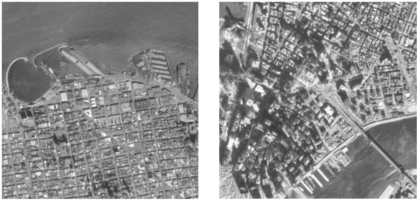
These one-meter resolution black-and-white images were collected October 11, 1999. The image on the left is of San Francisco and features Aquatic Park and Fisherman's Wharf. The image on the right is of New York City and features lower Manhattan including the World Trade Center and the Brooklyn Bridge (Images courtesy of Space Imaging).